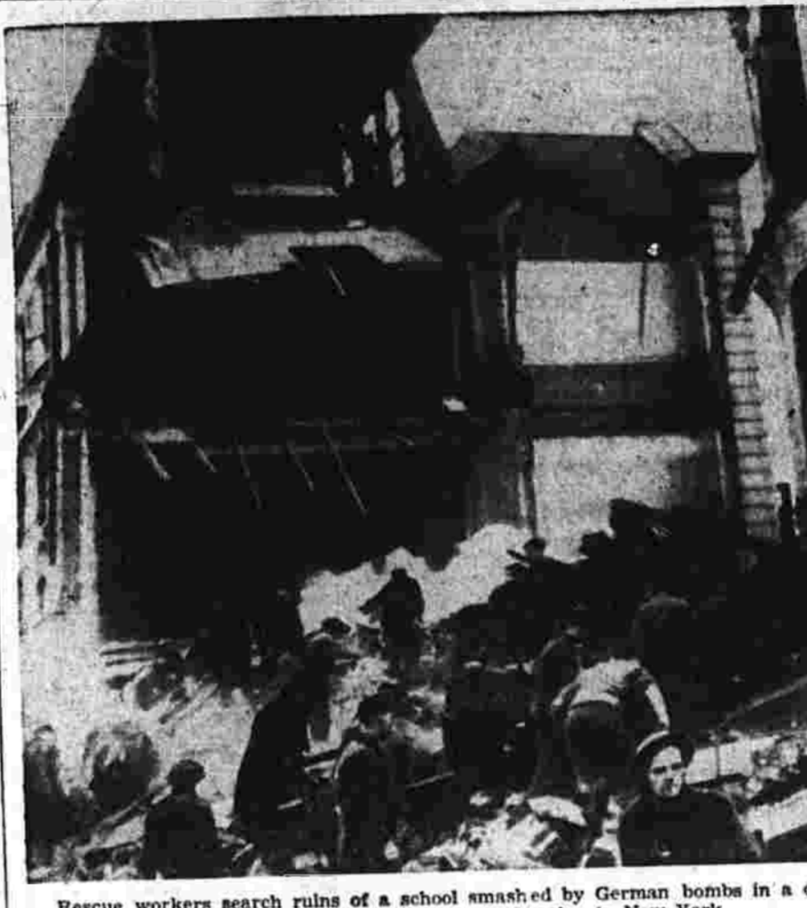
Rescue workers search ruins of a school smashed by German bombs in a daylight raid on London by Nazi planes. This picture was radioed from London to New York.